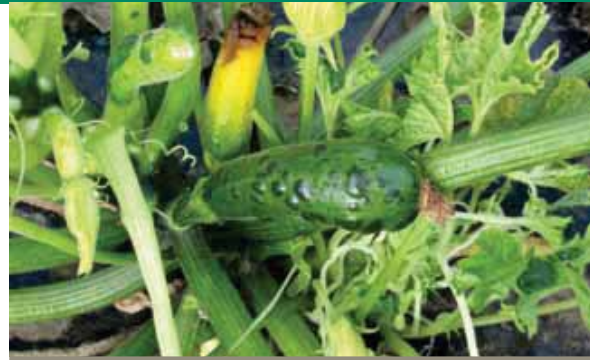
Mosaic symptoms on zucchini