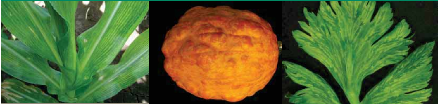
Left to right: Johnson grass mosaic virus symptoms on a corn leaf; papaya ringspot virus on a pumpkin; celery mosaic disease