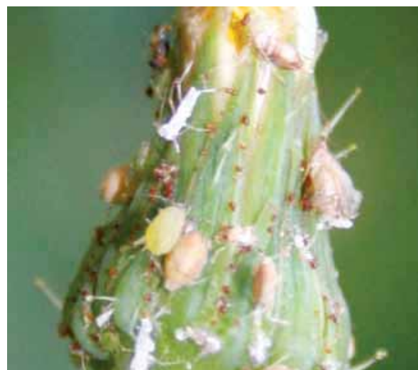
Aphids on a flower head