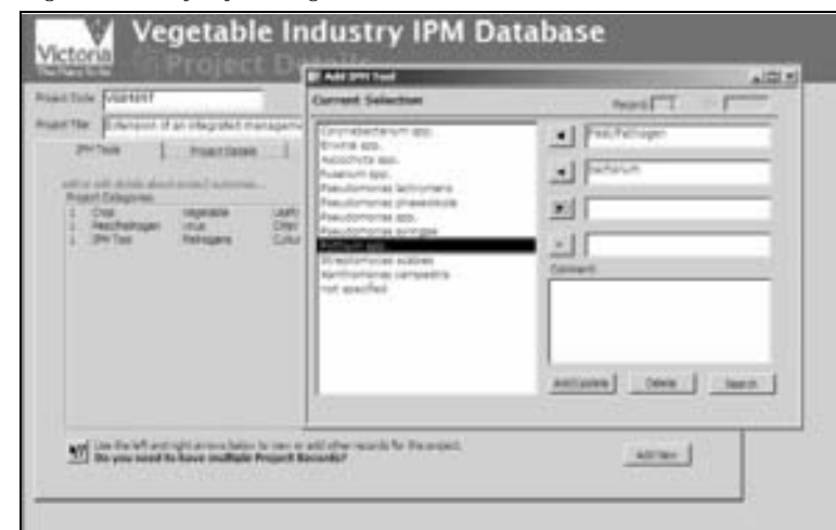
Fig 2. User Interface for adding an IPM Tool into the database

A frequency table of the IPM tools by crop is shown in Table 1. Currently, discussions are underway with Tony Burfield and representatives from AusVeg to look at incorporating this information into a format accessible to Growers.