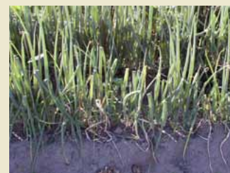
Onion white rot on spring onions