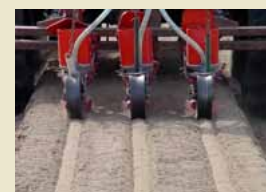
Seeder applying prills (yellow) below seed (black) with Trichoderma spores