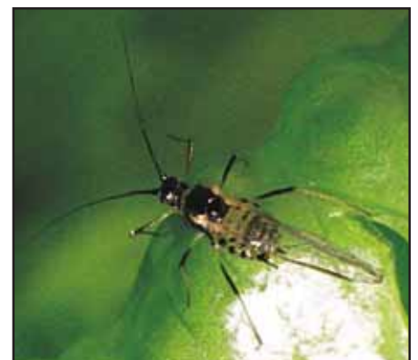
A winged Lettuce Aphid.

Growers with a strong IPM strategy and good populations of beneficial insects are in a better situation to manage lettuce aphid populations, particularly when they first arrive in a district.