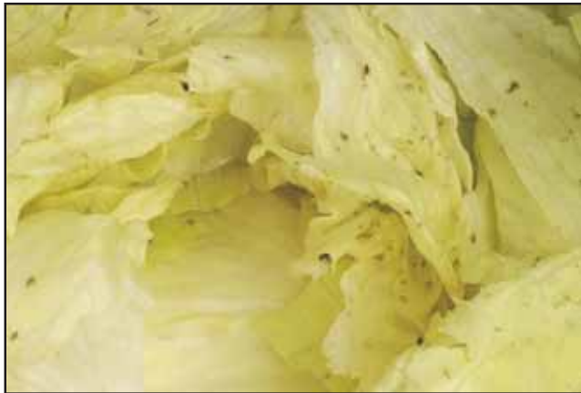
Contamination damage caused by Lettuce Aphids.

Lettuce head contamination by lettuce aphid makes them unsaleable. Lettuce aphid can also transfer cucumber and lettuce mosaic virus.